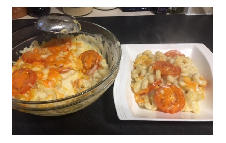
After Baking and Tasting Delicious